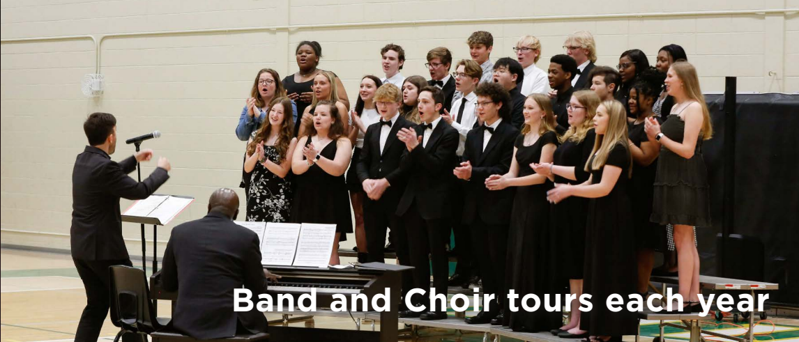
Band and Choir tours each year